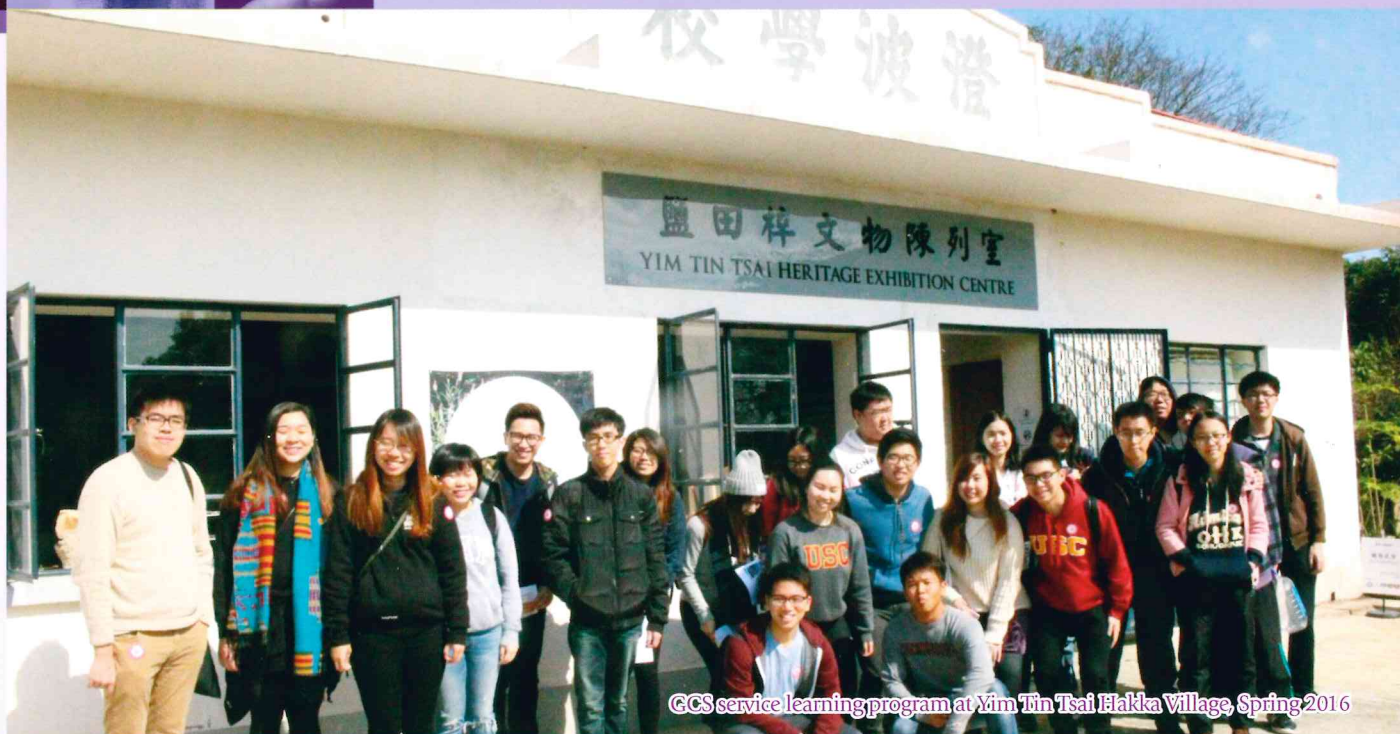
GCS service learning program at Yim Tin Tsai Hakka Village, Spring 2016

This year, 2016, marks the fifth year anniversary of the launch of the Global China Studies (GCS) undergraduate program, offered by the School of Humanities and Social Science (SHSS). Now in its sixth year (beginning September 2016), the program continues to go from strength to strength.